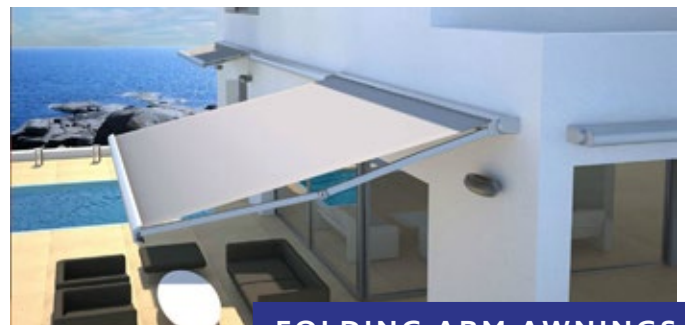
FOLDING ARM AWNINGS