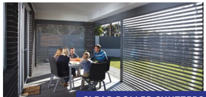
CLEAR ROLLER SHUTTERS