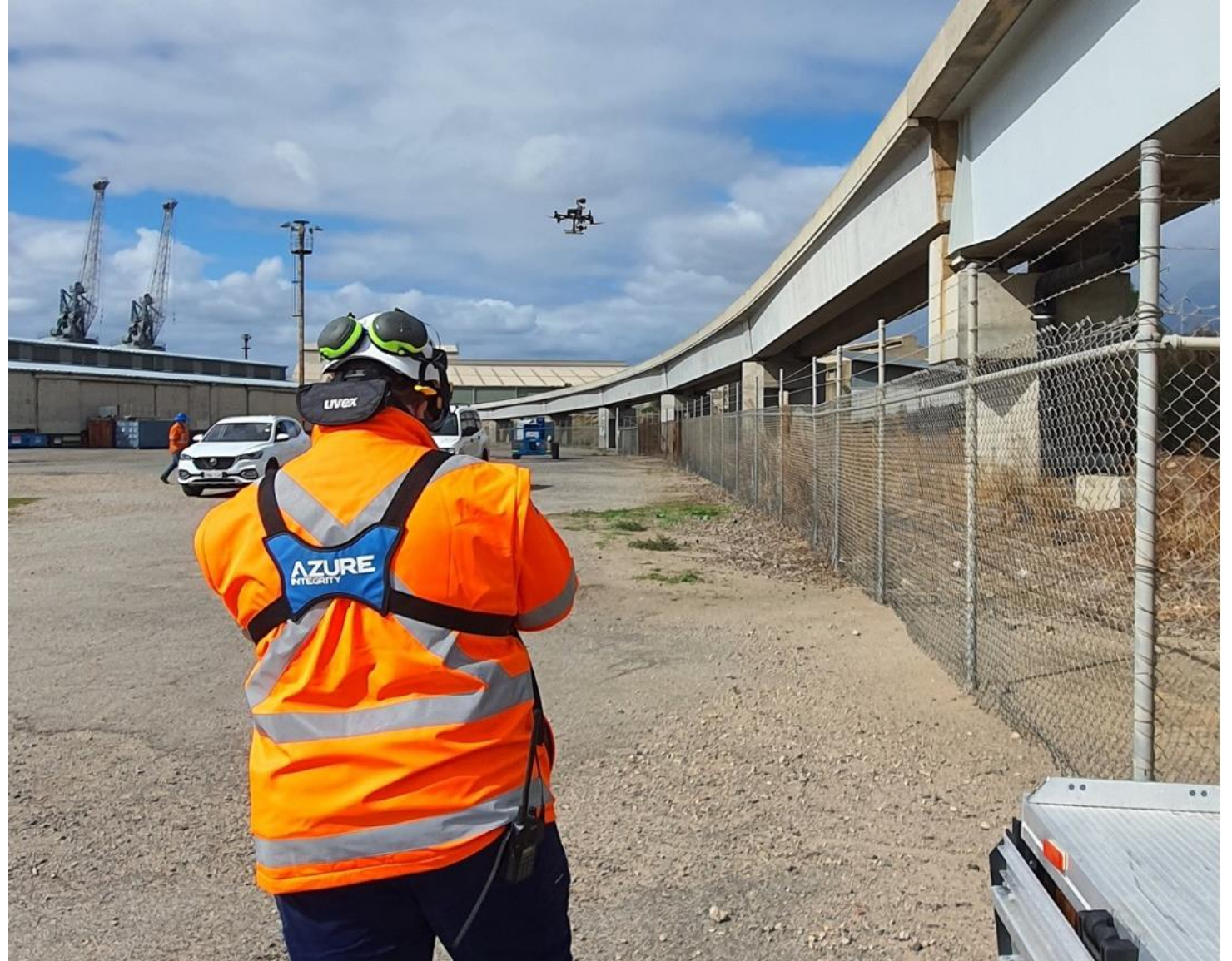
ARTC bridge and girder inspection (internal and external) pitt&sherry PORT ADELAIDE SA