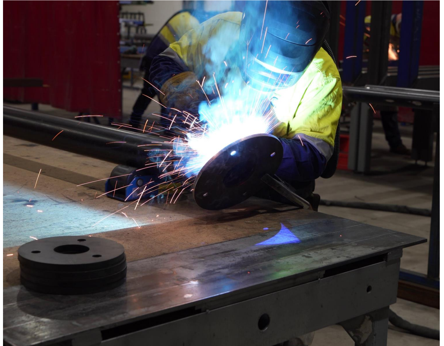
Fabrication works Co-Create Solutions Factory Lonsdale, SA