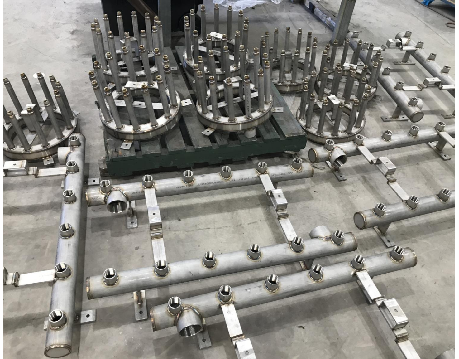
Waterplay infrastructure Gateway Shopping Centre Darwin, YARRAWONGA NT Client: Hydrilla